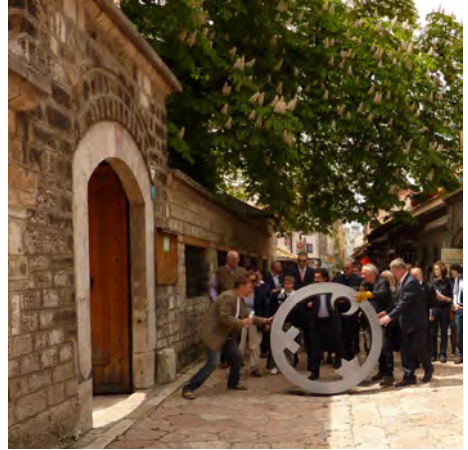
Sarajevo/ Bosnien Herzegovina