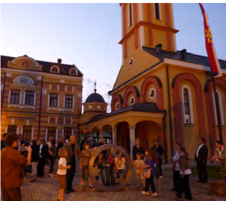
Dubica/ Bosnien Herzegovina