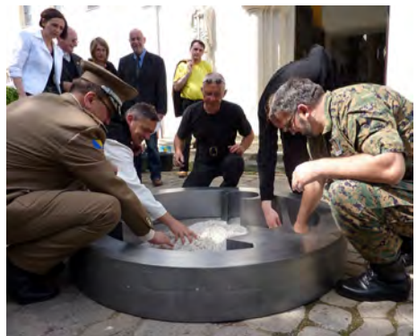
Militärgeistliche in Banja Luka